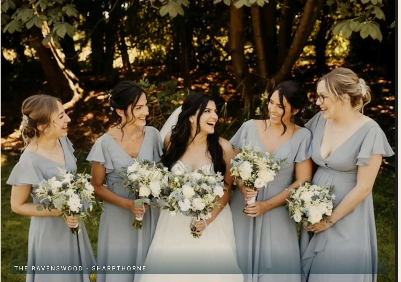
THE RAVENSWOOD · SHARPTHORNE