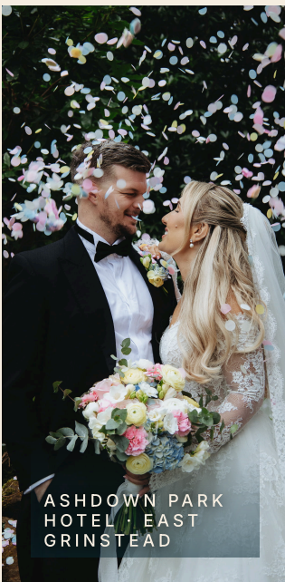
ASHDOWN PARK HOTEL · EAST GRINSTEAD