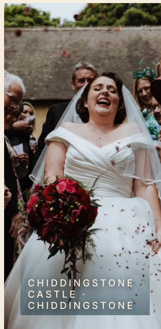
CHIDDINGSTONE CASTLE · CHIDDINGSTONE