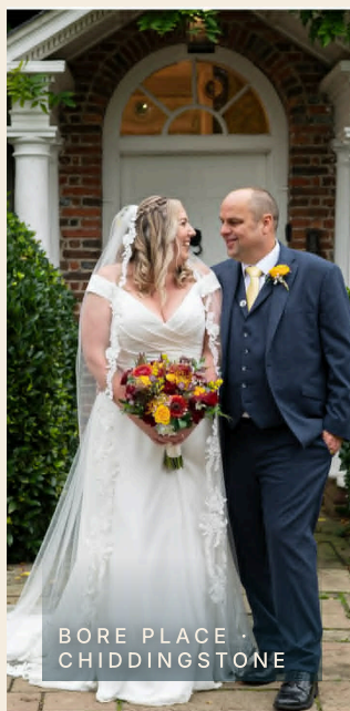
BORE PLACE · CHIDDINGSTONE